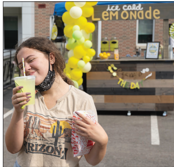
Local residents are invited to enjoy cool lemonade, along with treats, activities and live music at Family Fun Day.

Wrap up the summer with an afternoon of activities and treats at the Family Fun Day block party at Smith Village on 112th Place where the street will be closed between Western and Oakley Avenues, from 11 am to 4 pm on Saturday, August 26. All are welcome.