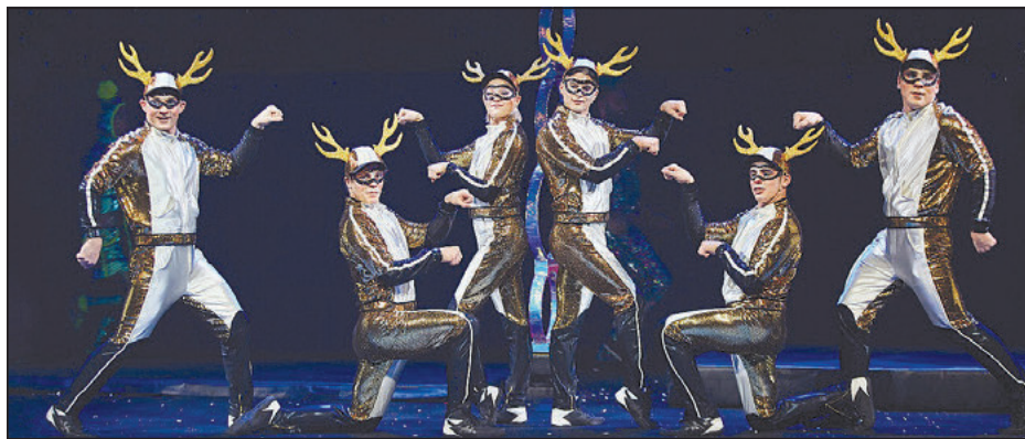
Cirque du Soleil's world premiere 'Twas the Night Before...

For more info, please call (708) 671-3700.