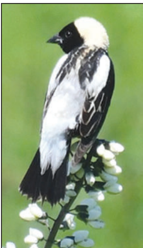
Bobolink sitting on Wild White Indigo at Orland Grassland.

by Orland Grassland Volunteers The Orland Grassland