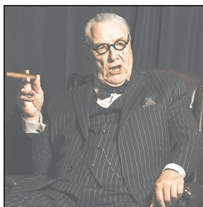
David Payne as Churchill.

Emery Entertainment, Inc. and Broadway In Chicago are excited to announce that Churchill , starring acclaimed actor David Payne, will play a strictly limited engagement at Broadway In Chicago's Broadway Playhouse at Water Tower Place 175 E. Chestnut St. from April 3 to April 7, 2024. Tickets for all shows are now on sale, priced at $75.00. Please visit BroadwayInChicago.com for more details.