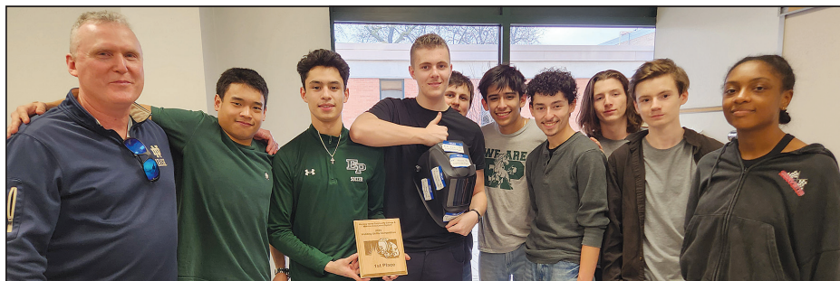
Mustang Welding team.