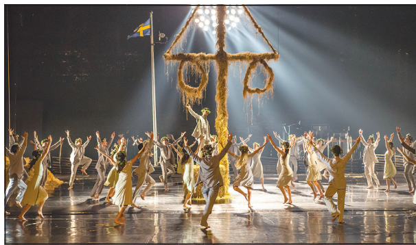
Midsummer Night's Dream.