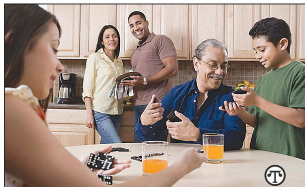
New wireless phone plans mean money savings and include Netflix.

Whether planning for long-term savings for retirement or for short-term expenses like a post-pandemic vacation, saving money is front and center in today's world. The good news is that there are so many great discounts created just for you that it makes it easy to save tons by paying attention to