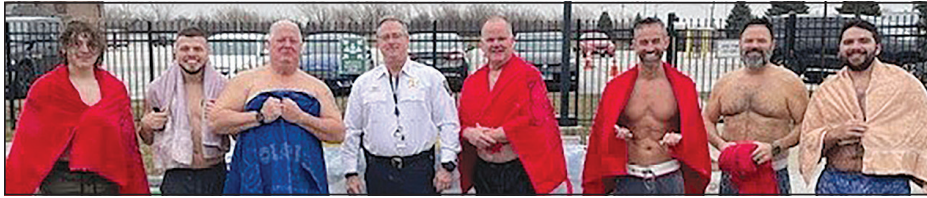
Member of Tinley Park Police Dept.

Mokena, Oak Forest, Orland Park, Tinley Park