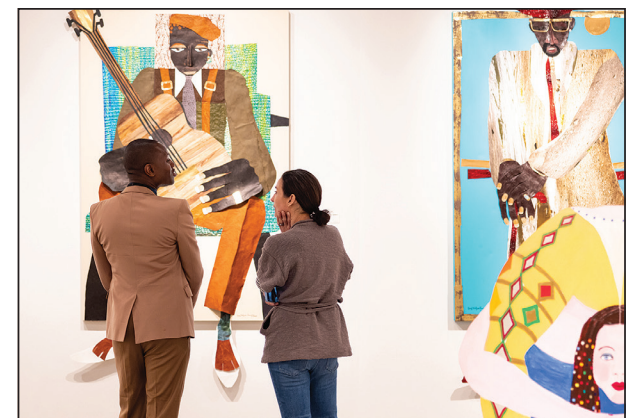
Expo Chicago 2023.

Tickets available now at www.expo-chicago.com .