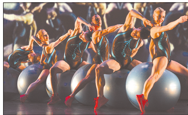
MOMIX Alice Caterpillar.