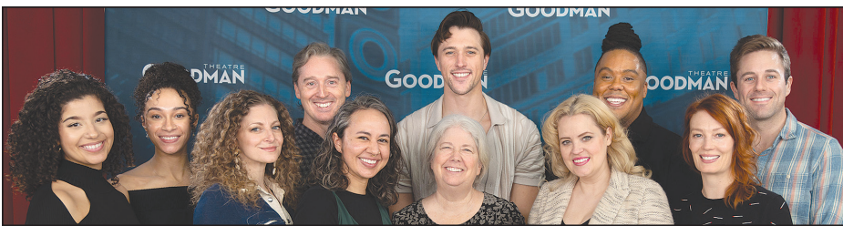
The Matchbox Magic Flute Cast.