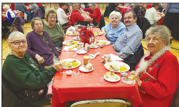
Senior Citizen's Breakfast.

Please RSVP to the school of your choice as