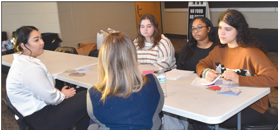
A group of employees from the Cook County State's Attorney's Office recently started a mentorship program with students from Richards High School who participate in Youth and Government.

Burbank, Evergreen Park, Hickory Hills, Justice, Oak Lawn