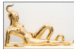
Sif Itona Westerberg Accendance .

Sif Itona Westerberg takes inspiration from "the Ancient Greek myth of