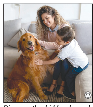
Discover the hidden hazards lurking within your home. From dust to pet dander and volatile organic compounds, indoor pollutants affect your health but simple strategies can clear the air for a healthier living space.