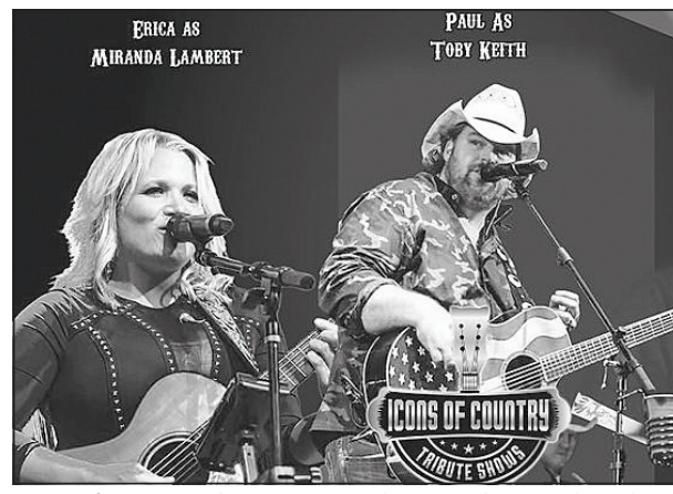
Icons of Country.

Get ready for a fun-filled evening country music fans! Two tribute artists! One energy filled night! Presenting the Made in America Icons of Country tributes to Toby Keith and