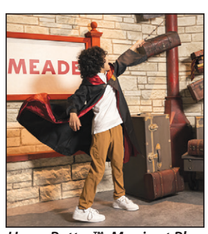
Harry Potter™: Magic at Play

Wizards and witches of all ages will now have even more opportunities to experience and celebrate the Wizarding World as Harry Potter: Magic at Play has released a new block of tickets to its world premiere run at Chicago's iconic Water Tower Place (835 N Michigan Ave.) through May 14, 2023. Created by Warner Bros. Discovery Global Themed Entertainment and Original X Productions (OGX), and co-presented by Fever, the first-of-its-kind experience allows fans of all ages to engage with the Wizarding World like never before through 30,000 square feet of hands-on magical interactivity including games, exploration, sensory activations and more that celebrate Harry's own journey in discovering the wizarding world.